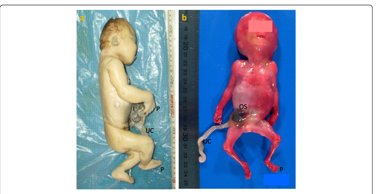
Fig. 2 Omphalocele in fetuses with trisomy 13. a Male Congolese fetus born dead. Ruptured omphalocele (o) with eviscerated small intestines (i) and umbilical cord (UC) inserted in the omphalocele. Dysmorphic facies with microcephaly, cleft lip, ears down inserted. Bilateral postaxial polydactyly (P) of hands and feet. b Male French fetus after termination of pregnancy. Intact omphalocele (o), dysmorphic facies with microcephaly, cleft palate, low set ears, postaxial hexadactyly of hands and feet

and umbilical cord insertion [9]: (i) epigastric (or cranial) omphaloceles, concern the upper abdominal wall and do not reach the umbilicus. The most severe form is the pentalogy of Cantrell. (ii) Central omphaloceles, concern the middle abdominal wall and are periumbilical. They are the most common. (iii) Hypogastric (or caudal)